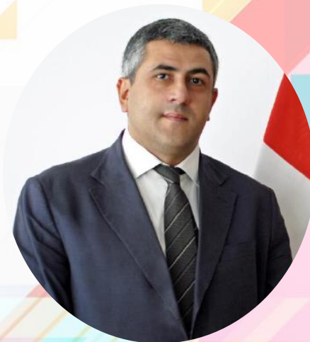
ZURAB POLOLIKASHVILI SECRETARY GENERAL AT THE UNWTO