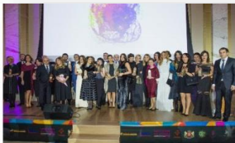
WELCOME TO GEORGIA NATIONAL TOURISM AWARDS SECOND OFFICIAL CEREMONY

On December 3, 2018, the National Tourism Awards Ceremony took place in the Grand Ballroom of the Sheraton Hotel in Tbilisi. The event was attended by over 200 guests, including representatives of the tourism industry, media, and government officials. The ceremony was hosted by the National Tourism Awards Jury, which consists of experts from various fields of tourism. The winners of the awards were announced during the ceremony, and the winners received their awards from the jury members. The ceremony was a success, and it was a great opportunity for the winners to showcase their achievements and for the organizers to promote the tourism industry in Georgia.