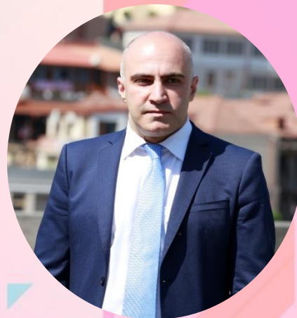
GEORGE CHOGOVADZE GENERAL DIRECTOR OF UNITED AIRPORTS OF GEORGIA